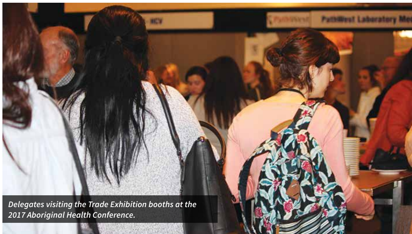
Delegates visiting the Trade Exhibition booths at the 2017 Aboriginal Health Conference.

Your involvement will be featured in all printed material from the time you confirm your commitment, subject to printing deadlines.