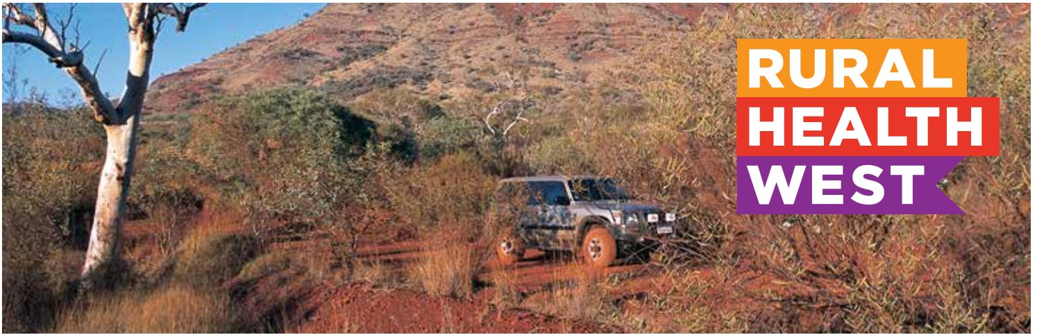
Road to Mt Nameless, Tom Price.