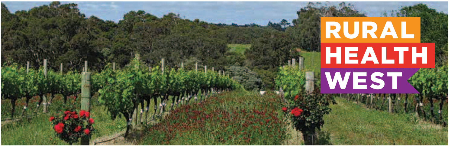
Voyager Estate Winery, Margaret River.